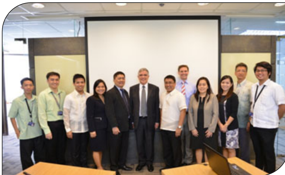
Australian Ambassador to the Philippines Bill Tweddell with the 1 st and 2 nd RPET Intake trainees from the Intellectual Property Office of the Philippines and their Local Supervisors (January 2015).

Patents allow innovators to recoup their investments in and profit from their invention by preventing others from copying and commercially using their product without the patent holder's consent.