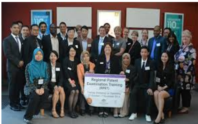
2014 RPET Trainees and their IP Australia Trainers